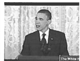
MSNBC Analyst Suspended For Calling Obama a 'D**K'