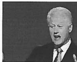
Bill Clinton to Republicans: Thanks But No Thanks