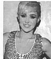
Short Story: Great Cropped-Hair Looks eHow