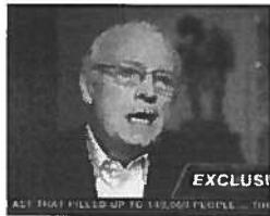
Cheney On Obama: 'He's Been A Terrible President'