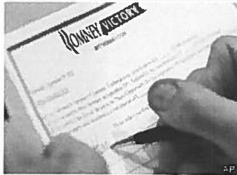
A donor fills out a contribution form at a Mitt Romney fundraising event in Atlanta on Sept. 19, 2012.

Posted: 05/03/2013 9:17 am EDT | Updated: 05/03/2013 1:03 pm EDT