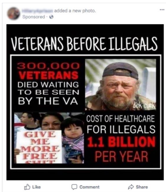
Content provided by Project DATA**