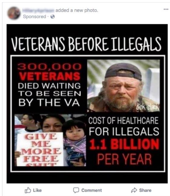
Content provided by Project DATA*